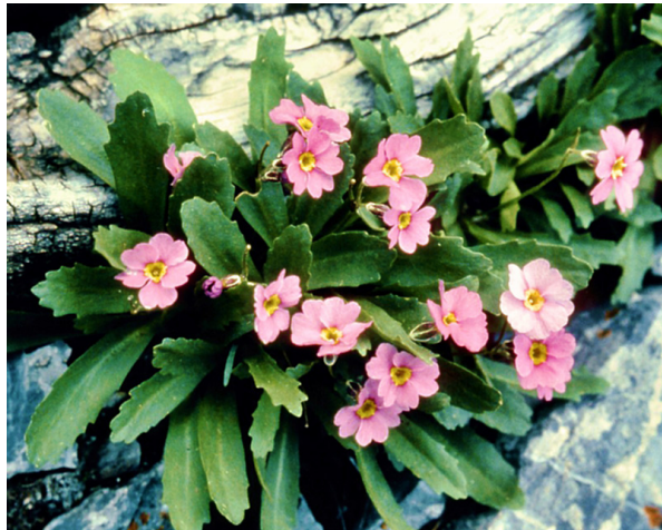
Primula nevadensis.