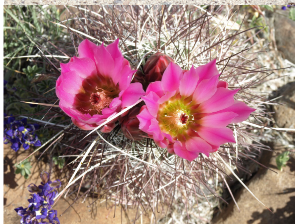
Sclerocactus polyancistrus . Top: NNPS members during a 2014 field trip. Only pictures (not the cactus) were taken. Bottom photo by James Morefield