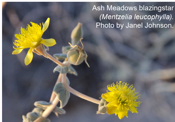
Ash Meadows blazingstar ( Mentzelia leucophylla ).